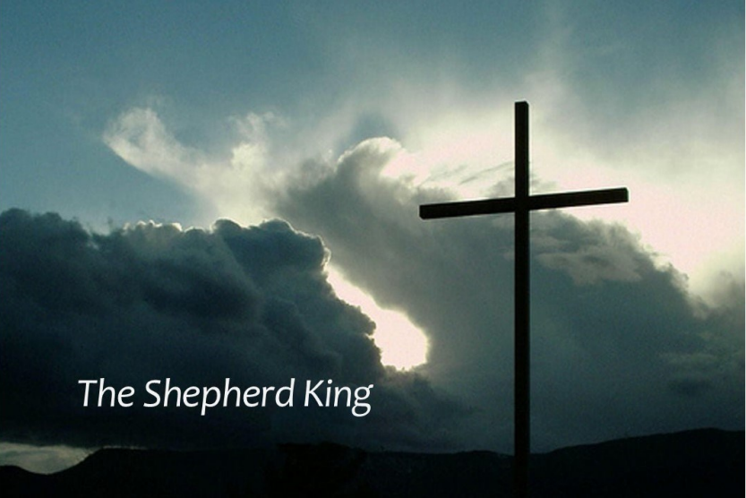
The Shepherd King

113 West Central Avenue | Van Wert, Ohio 45891 | 419-238-0631 | vanwertfirst.net